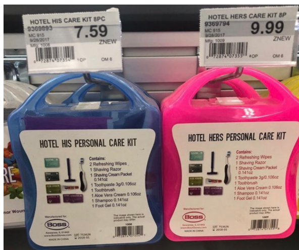
([Personal Care Kits at Ace Hardware], 2019)