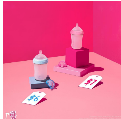
(European Wax Center, 2018)